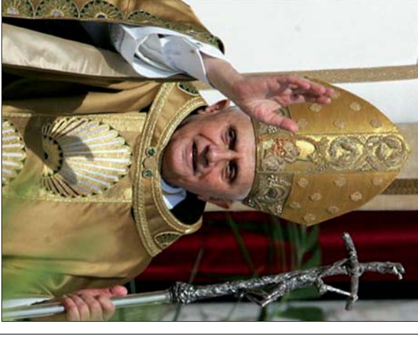
pe benedict Av

But from Mankind everyone may come. I am welcoming them. If I have enough possibility to make a welcome for him, I will do. Although I am a zero person, he has an honour. I am a poor one, an old person, but I am happy if it comes to His Holiness' heart to visit. He is welcome. I will even come out of my house to welcome him and salute him. He must not be in doubt, thinking, "What is his deal with me?" No, we are respectful people, we are respectful people. Salafi 'ulama', what you are saying?