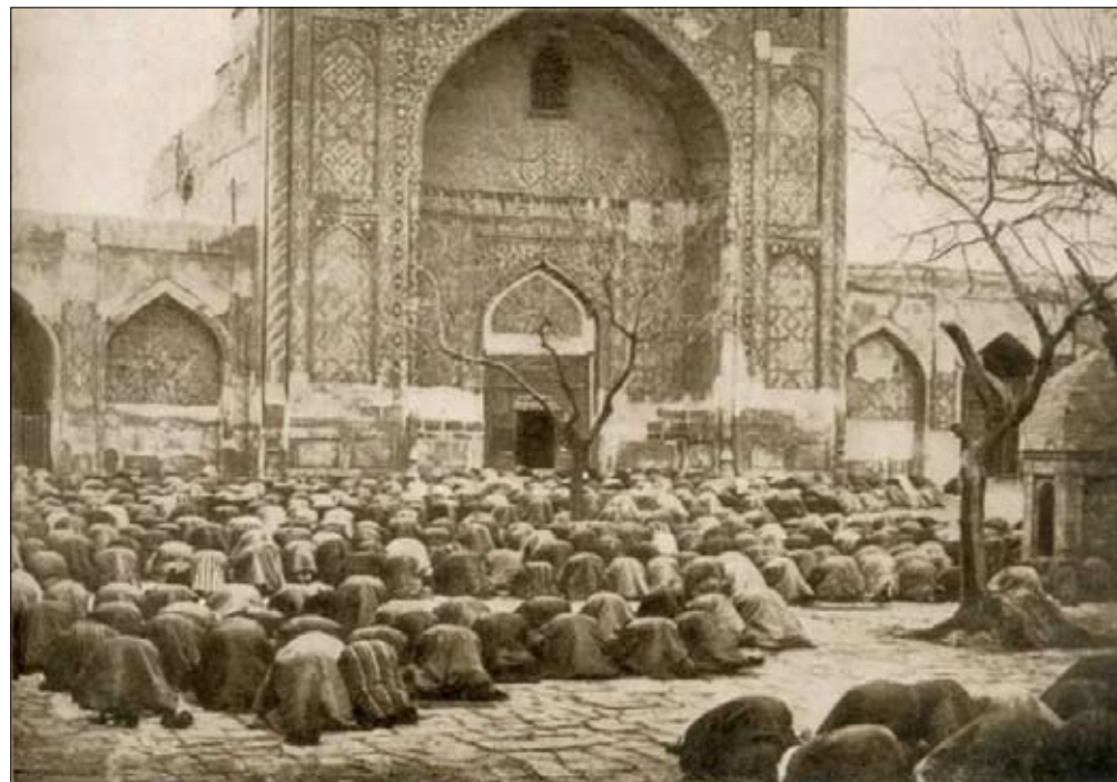
Ṣalātu l-juma‘a in front of the madrasah Tilla Kari in Samarkant

Allāh will not leave those foolish people to say: “Islam is imperfect and we are perfect.” No! I hope that this year all of them will be finished!