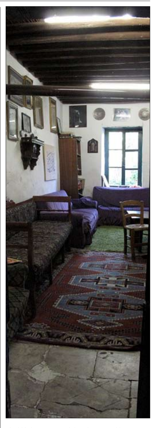
Sheikh's house.

The Expected Paraclete by Spohr Publishers Ltd, Lympia, Cyprus in connection with the podcast with Maulānā Sheikh Nāzim al-Ḥaqqānī »Before Armageddon« www.before-armageddon.com. www.spohr-publishers.com Resp. Salim Spohr