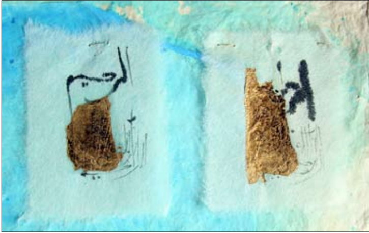
Calligraphy Hanā' Horack