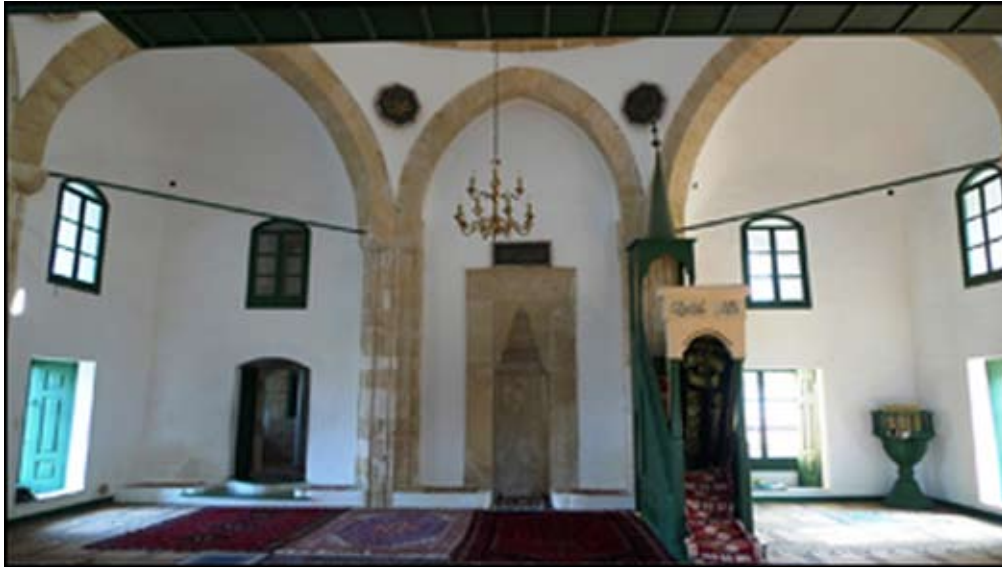
Hala Sultan Tekke, Larnaca

never gives you anything here or hereafter. We are all servants of the Lord of Heaven and we are in need of heavenly support, spiritual support. This is most important for mankind, but now they are heedless. They are drunk! They are becoming drunk on the material world which they are running after to fulfill their wishes, but it is nothing. Everyone is drinking from Dunyā, and the drinks of Dunyā are making people drunk. And drinking is carrying people from bad