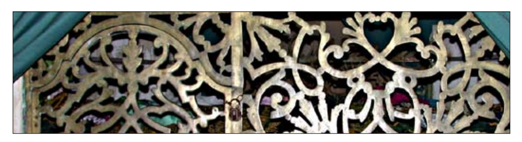
Maqām of the Holy Lady Umm Hirām Bint Milhān, raḍiya llāhu 'anha.

It has reached me from old knowledge in the holy books that the Prophet, peace be upon him, the Seal of Prophets, was informing us, that a person when he is buried in the graveyard will be questioned, and after that questioning one door will open in the grave